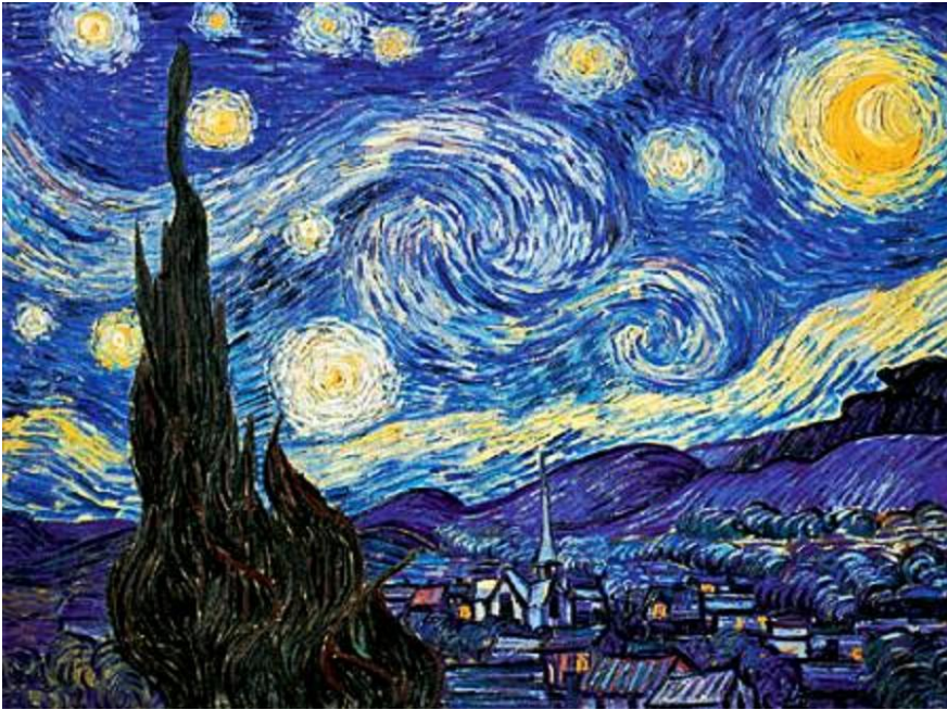
The Starry Night