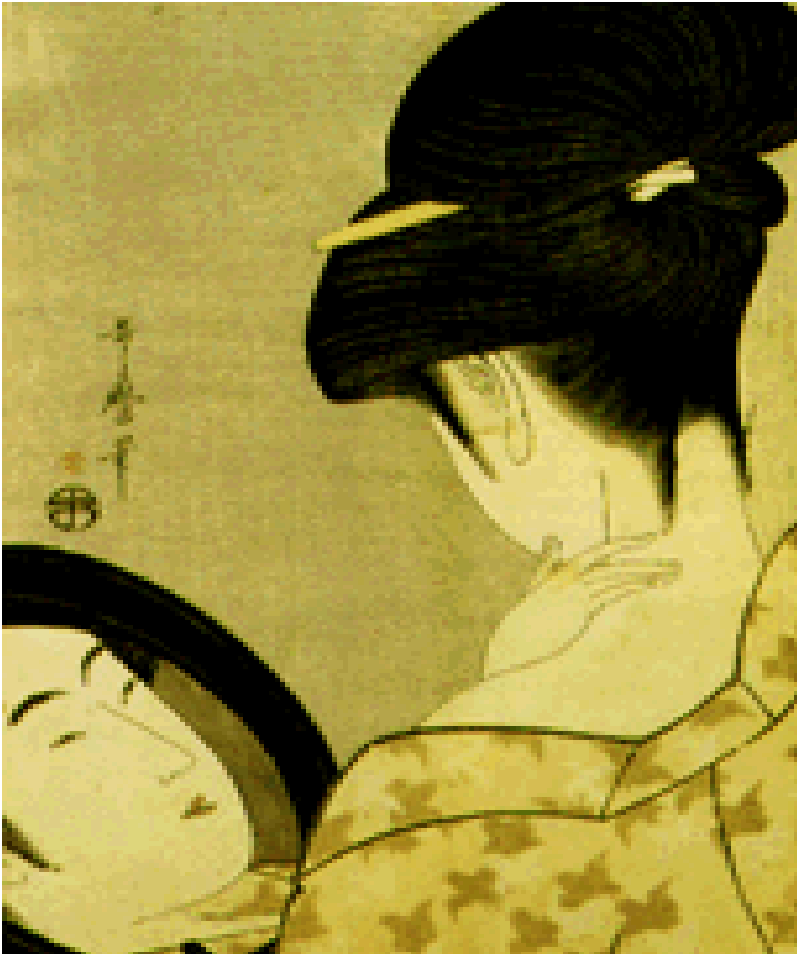
Girl Powdering Her Nick