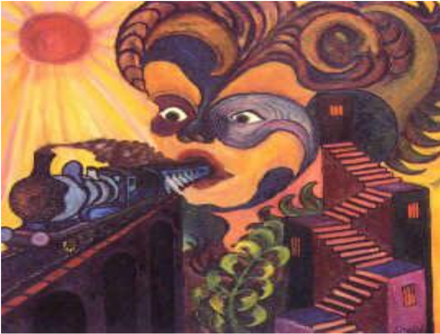
Stop Smoking or Would Fire Have Listen to Reason