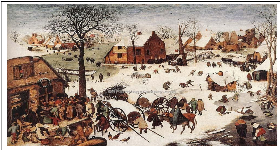
Numbering at Bethlehem

poem that carries the name of the museum. Auden is multi gifted artist his interest surpasses poetry to include" librettos (opera texts) and motion pictures document arise "( Press 186)The selection is so indicative since Auden does not refer to one paintings but to three paintings that are written by Brueghel(1520-1569),the sixteen-century Belbian artist. The paintings are quite significant since they turn to be a source of inspiration for many poets .Auden`s attraction to Brueghel`s because of " his translation of ancient Greek and Midwestern narratives into lowlands, often snowbound, setting are themselves so radically uprooted and displaced that seem precursors of modernist and art" (Johnstone 216). Auden does not translate the meaning of the painting as many poets do but he borrows the theme of the painting to support the general theme of the poems , so his" works are on display in the eponymous museum of the poems"(Yu 165). He views the images according to their reflection on his soul.